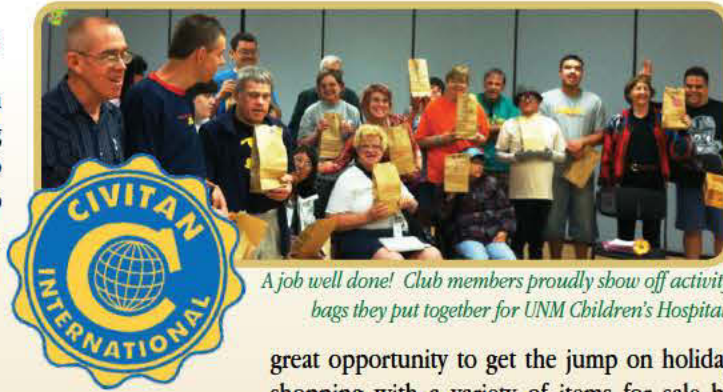
A job well done! Club members proudly show off activity bags they put together for UNM Children's Hospital.

Organized fund raisers enable Civitans to purchase needed materials for service projects and ARCA Buddies has one already scheduled. Mark your calendars for Saturday, November 9th, 11 a.m. to 3 p.m. for the District Civitan Claus for a Cause at the Golf Training Center, Balloon Fiesta Park (behind the Balloon Museum). This will be a