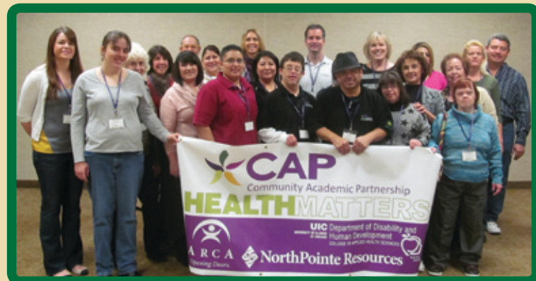
Affiliates from all regions of New Mexico.

Health Matters is improving the health of hundreds of New Mexicans with developmental disabilities.