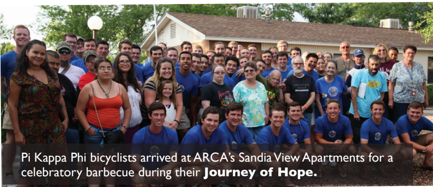
Pi Kappa Phi bicyclists arrived at ARCA's Sandia View Apartments for a celebratory barbecue during their Journey of Hope .