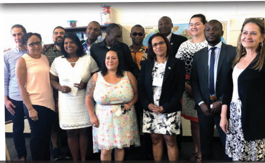
Global Ties ABQ brought leaders from around the world to exchange ideas about enriching the lives of people with disabilities.