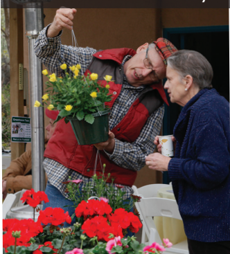
Our most gorgeous spring plants yet debuted at ARCA's Geranium Celebration!