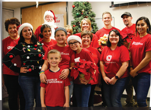
Thanks to the Bank of Albuquerque and Albuquerque's East Stake of the LDS Church , our Holiday Season was especially magical.