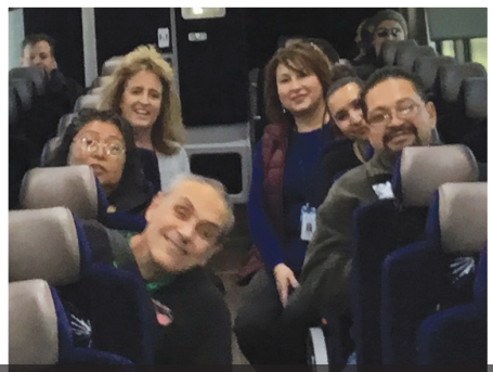
By bus and by rail, individuals receiving services arrived in Santa Fe for ARCA's 2018 Legislative Day .