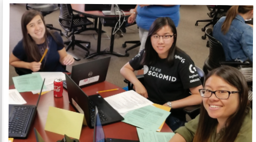
A brilliant community of volunteers including Beta Alpha Psi students and professionals from REDW, Atkinson, UNM ASM and ARCA prepared and submitted tax returns for 219 ARCA individuals.