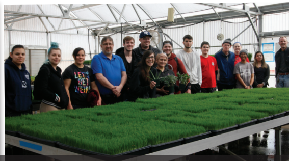
Very special thanks to everyone who gave their time and energy to ARCA Organics, including ABQ Vietnam Veterans, Albuquerque Academy, ABQ the Magazine, KEVA Juice, Intel, Bank of the West, Global Ties, Master Gardeners and Gap!