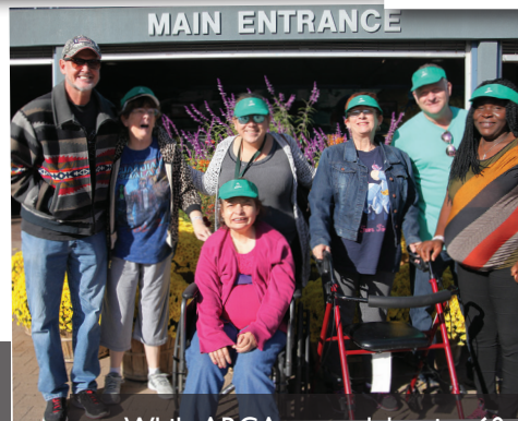
While ARCA was celebrating 60 years, the ABQ BioPark Zoo was celebrating 90, making ARCA Day at the Zoo more fun than ever!