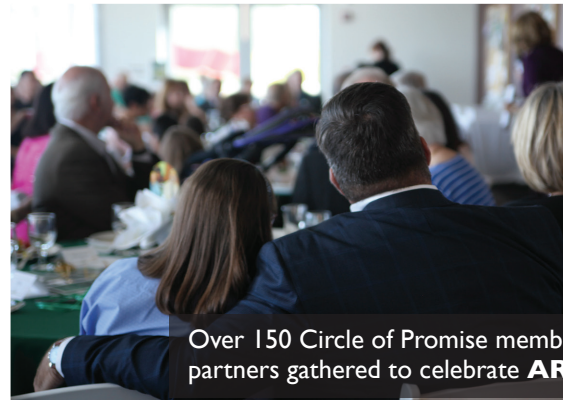
Over 150 Circle of Promise members and key community partners gathered to celebrate ARCA's 60th Anniversary .