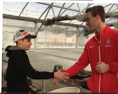
Employees at ARCA Organics received a surprise visit from members of the UNM Lobo Baseball Team!