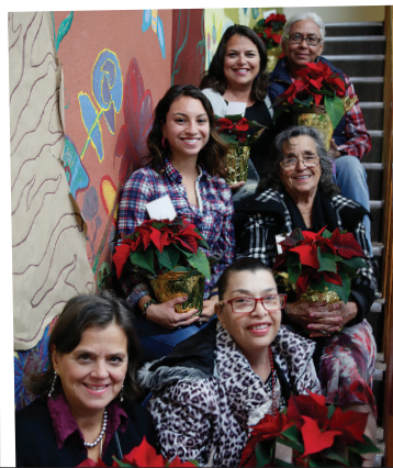
Our annual Poinsettia Celebration kicked off the season with gratitude for our entire ARCA Family.