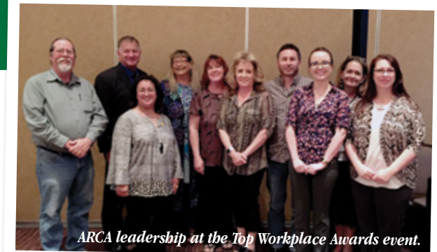
ARCA leadership at the Top Workplace Awards event.

At a public hearing held June 19, DDSD announced they intend to accept the recommendation of the report and will ask $12.5 million be included in the Governor's budget. If approved, CMS would match these funds with an additional $33.25 million (NMFMAP at 72.71%). If you would like to view PCG's preliminary rate recommendations, please visit our website at ARCAOpeningDoors.org/PCG-report . The final report