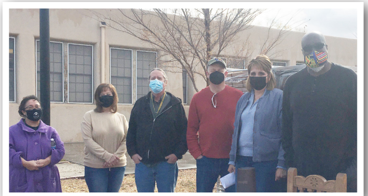
With the help of City Treats Catering, ARCA gave thanks by distributing 450 holidays meals to staff and individuals receiving services.