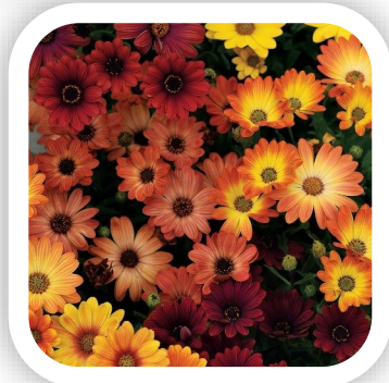
Sunset Shades Mix