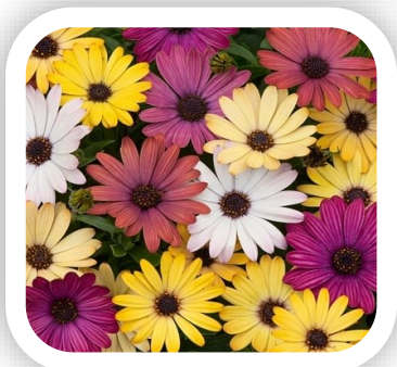
Grand Canyon Mix