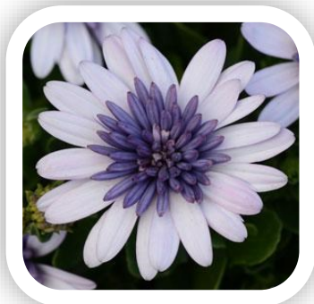
4D Violet Ice