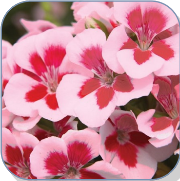
American Rose Mega Splash