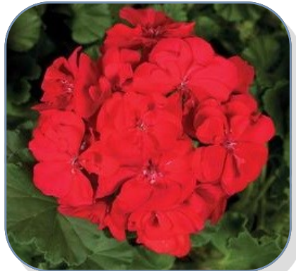
Tango Dark Red