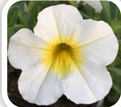
MiniFamous Neo White Yellow Eye