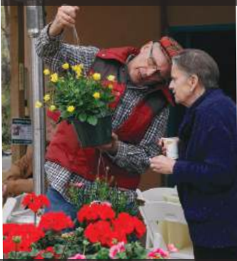
Our most gorgeous spring plants yet debuted at ARCA's Geranium Celebration!