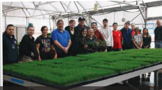
Very special thanks to everyone who gave their time and energy to ARCA Organics, including ABQ Vietnam Veterans, Albuquerque Academy, ABQ the Magazine, KEVA Juice, Intel, Bank of the West, Global Ties, Master Gardeners and Gap!