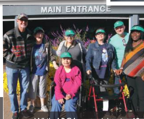
While ARCA was celebrating 60 years, the ABQ BioPark Zoo was celebrating 90, making ARCA Day at the Zoo more fun than ever!