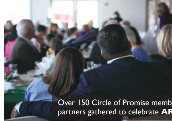
Over 150 Circle of Promise members and key community partners gathered to celebrate ARCA's 60th Anniversary .