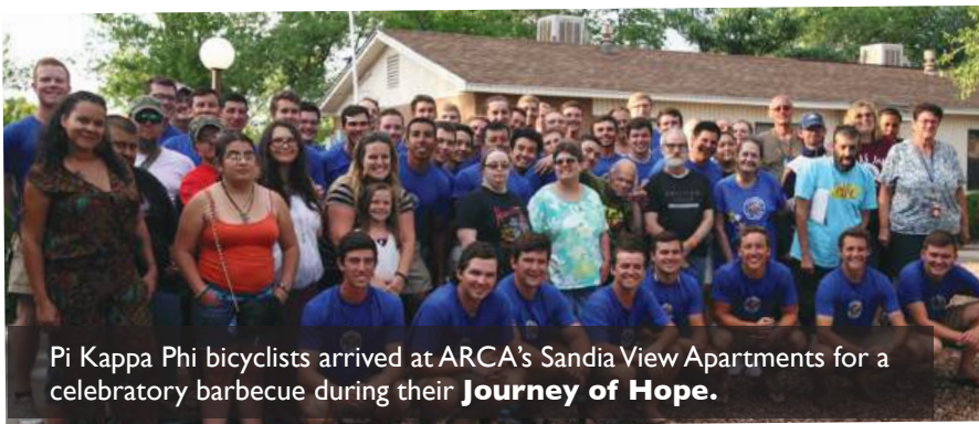
Pi Kappa Phi bicyclists arrived at ARCA's Sandia View Apartments for a celebratory barbecue during their Journey of Hope .