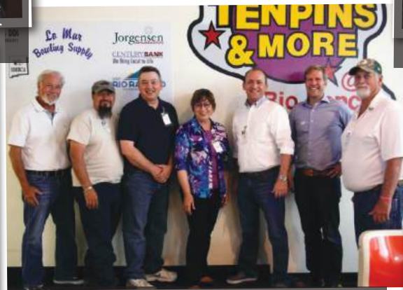
ARCA celebrated a decade of fun at the 10th Annual Bob Scanlon/Steve Mackie Bowl-a-Thon featuring Mayors on Strike .