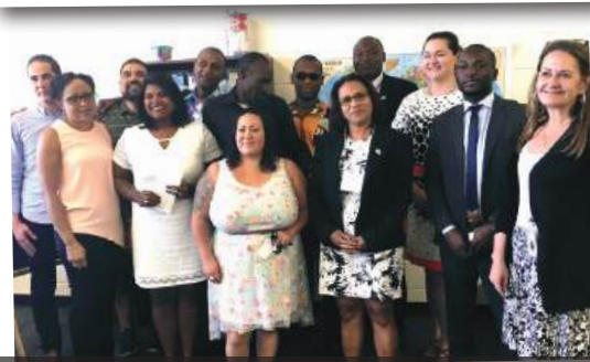
Global Ties ABQ brought leaders from around the world to exchange ideas about enriching the lives of people with disabilities.