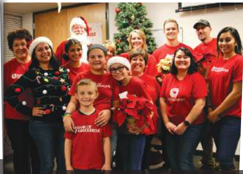
Thanks to the Bank of Albuquerque and Albuquerque's East Stake of the LDS Church , our Holiday Season was especially magical.