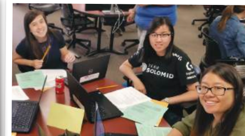
A brilliant community of volunteers including Beta Alpha Psi students and professionals from REDW, Atkinson, UNM ASM and ARCA prepared and submitted tax returns for 219 ARCA individuals.