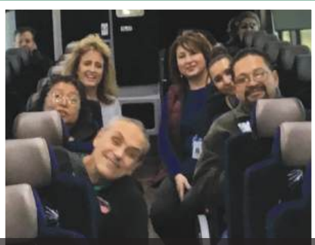
By bus and by rail, individuals receiving services arrived in Santa Fe for ARCA's 2018 Legislative Day .