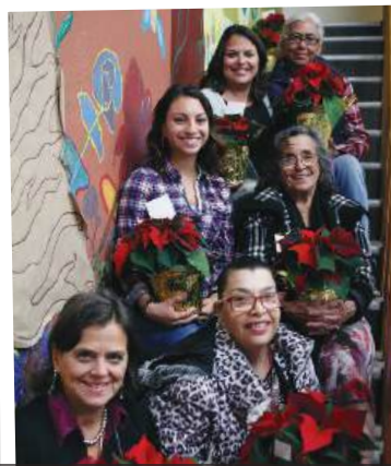
Our annual Poinsettia Celebration kicked off the season with gratitude for our entire ARCA Family.