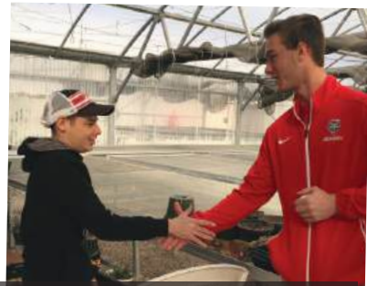
Employees at ARCA Organics received a surprise visit from members of the UNM Lobo Baseball Team!